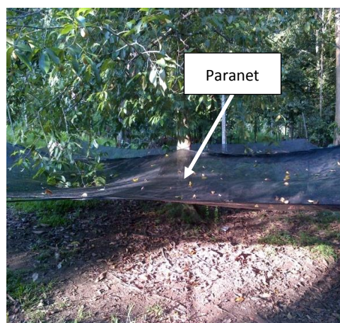
Figure 1 A paranet installed under each nutmeg tree to catch the ripe nutmeg fruits that naturally fell from the nutmeg trees

Ripe fruits of nutmeg were collected one week after they had fallen from nutmeg trees. A paranet was placed under each nutmeg tree to prevent the ripe nutmeg fruits from falling on the ground. The paranet was placed at 1 m above ground (Fig. 1).