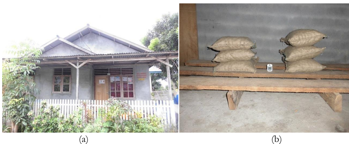
Figure 3 Condition at the outside (a) and the inside (b) of the warehouse used for storing nutmeg seeds for four months

of storage. Insects found in nutmeg were separated from nutmeg using a sieve. The insects were then preserved in vials containing 70% ethanol. Each sample of nutmeg seeds was mixed homogeneously. Nutmegs-in-shell were then shelled using a hammer to get nutmeg kernels. After that the nutmeg samples were separated into eight parts i.e., two parts were used for determining the percentage of damaged kernels, while the other six parts were used for determining the moisture content, fungal population, and aflatoxin content. Subsequently, the six parts were ground using Mill Powder Tech Model RT 04 and mixed homogeneously on a plastic tray (40 x 30 x 5 cm). The ground nutmeg was then divided into eight parts to be used as working samples, i.e., one part for determining moisture content, three parts for determining fungal population, and four parts for determining total aflatoxin content.