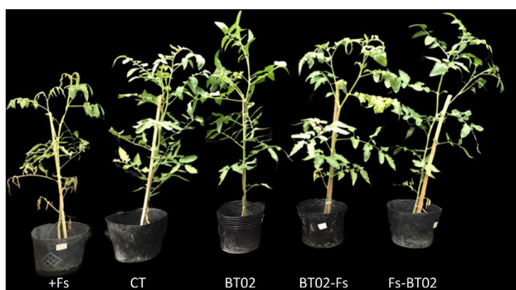
Figure 4 Efficiency to control root rot disease of the BT02 strain +Fs: Inoculated with Fusarium solani ; CT: Control; BT02: Inoculated with BT02; BT02-Fs: Inoculated with BT02 24 hours before Fusarium solani (Fs); Fs-BT02: Inoculated with BT02 24 hours after Fusarium solani (Fs).

Note: Numbers with the same superscript in the same column indicate non-significant statistical differences ( \alpha = 0.01 ). AUDPC: area under the disease progress curve; DAI: days after inoculation.