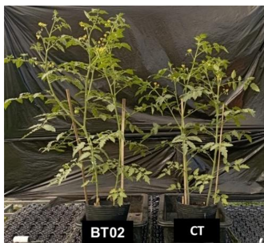
Figure 2 Tomato plants at 28 days after inoculation with Streptomyces rochei BT02 CT: control; BT02: Streptomyces rochei BT02.

Note: Numbers with the same superscript indicate non-significant statistical differences ( \alpha = 0.05 ).