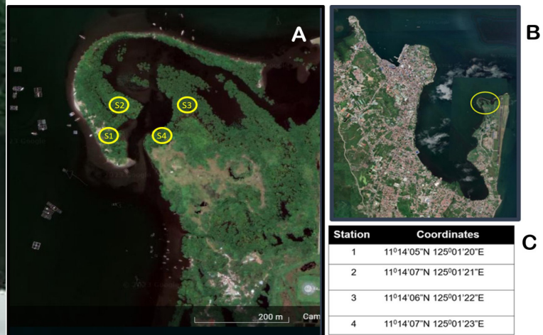
Figure 1. Research Locale (A) The four permanent transect lines established in the sampling sites were labeled S1, S2, S3, and S4, respectively. (B) A map of Tacloban City, emphasizing the sampling site, encircled its exact position and proximities from water bodies. (C) A table was inserted to stress the GPS coordinates of the sampling sites.

Four permanent transect lines were laid in Brgy. Alimasag, Tacloban City, is part of the Kataisan Point, a tapering piece of land extension from mainland Leyte Island distending to Cancabato Bay and Leyte Gulf. This area is at the tip of Tacloban City DZR Airport, impending the construction of the Causeway Project embankment. During Haiyan, this area was totally obliterated, generating 7m+ surges.